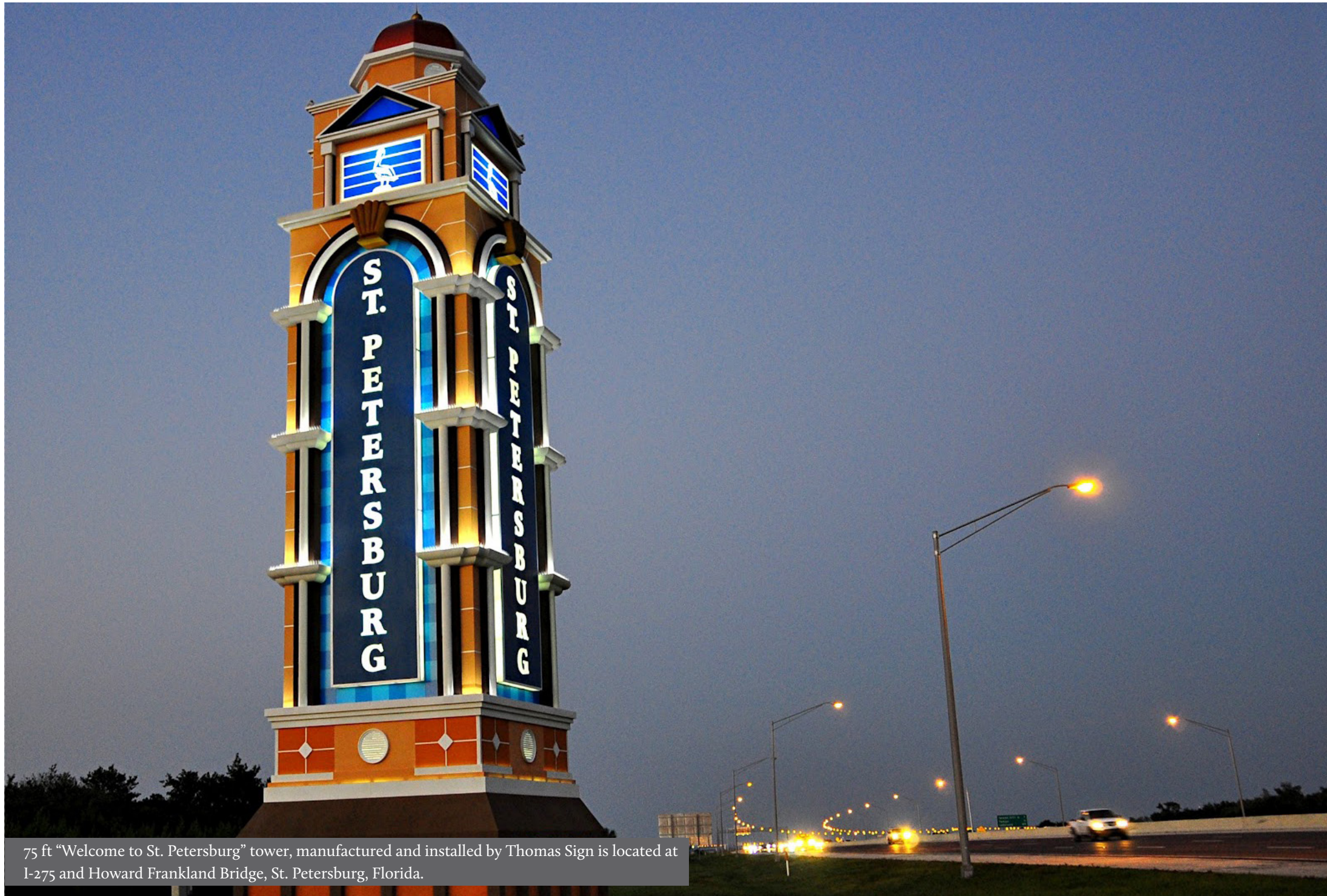
75 ft "Welcome to St. Petersburg" tower, manufactured and installed by Thomas Sign is located at I-275 and Howard Frankland Bridge, St. Petersburg, Florida.