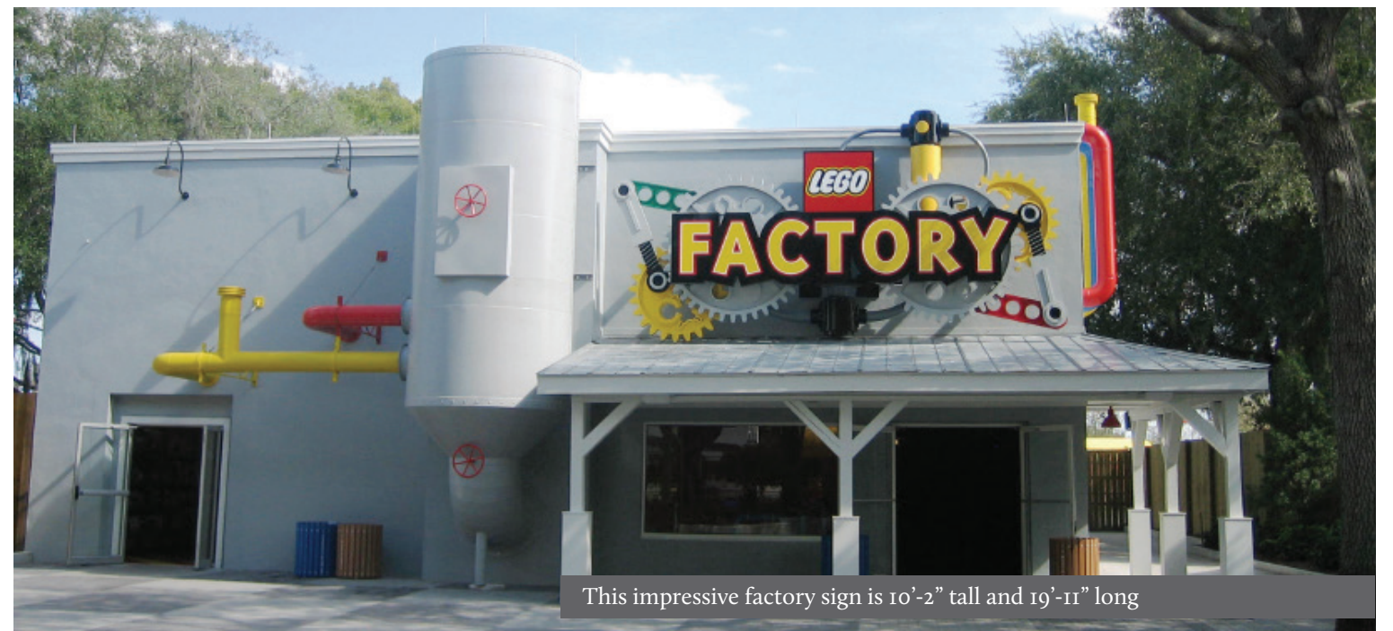
This impressive factory sign is 10'-2" tall and 19'-11" long

Wide-format digital printing is a creative way to promote your message. Thomas Sign uses a high-definition, wide-format digital printer that has no boundaries on creating options for practically any surface type. Our experienced digital staff will work with you to unveil the unlimited applications and endless possibilities that are available to you through digital printing.