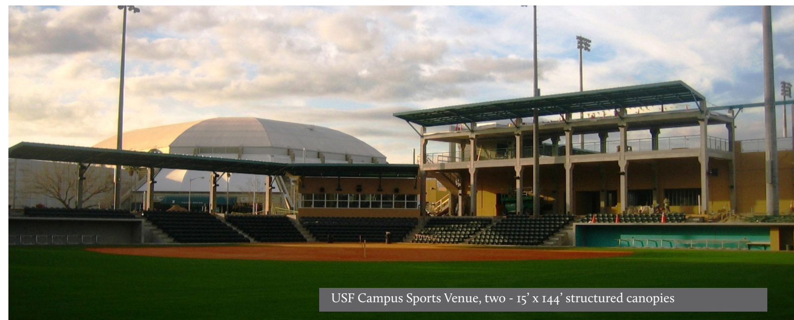
USF Campus Sports Venue, two - 15' x 144' structured canopies

Awnings and canopies are attractive ways to enhance your location and are inviting to customers. Thomas Sign made their first awning in 1972, and today, awnings and canopies are part of our primary manufacturing process. Our designers will make sure that your designs are architecturally pleasing, safety compliant and meet all municipality codes.