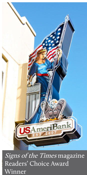
Signs of the Times magazine Readers' Choice Award Winner